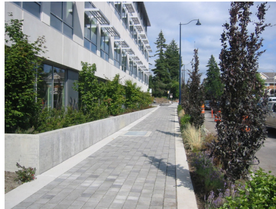
Stormwater infiltrates through to the Silva Cell system through pervious pavers as well as curb cuts.

Stormwater management and attendant flooding and pollution are among the biggest challenges facing urban areas and other heavily paved environments. As a result, designers are increasingly turning to green utilities such as trees and soil as solutions to help restore dysfunctional ecosystems in densely populated areas.