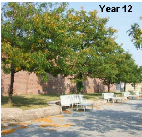
Trees in open loam planter: Appr. 275 cf net soil/tree

Long-term observations of trees growing in Structural Soil compared to nearby trees in loam soil volumes of similar volumes have been recorded (Urban 2008-2010). In comparably sized spaces, some filled with Structural Soil and some filled with loam soil, trees in the loam soils have been observed to consistently grow significantly larger. At a Structural Soil prototype planting in Staten Island, New York, one row of trees were planted in Structural Soils and one row in an adjacent open loam soil planter. The open planter