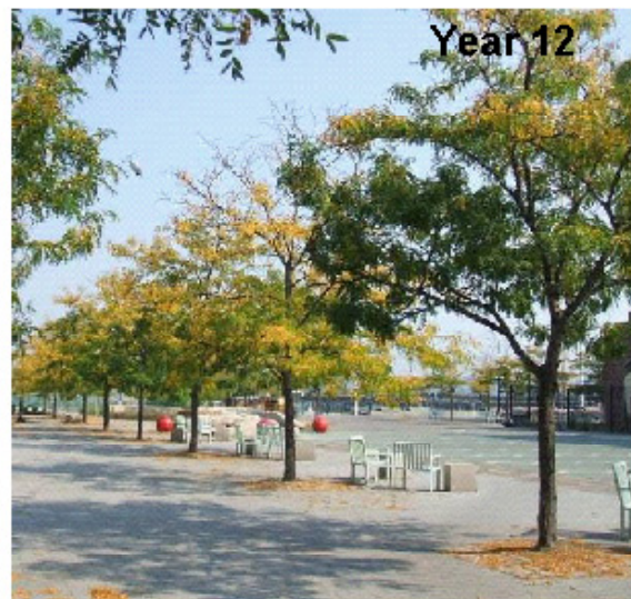
Trees in CU Soil Appr. 175 cf net soil/tree (350 cf of CU Soil)

limited, ability to deliver soil more efficiently creates a significant advantage for using Silva Cells.