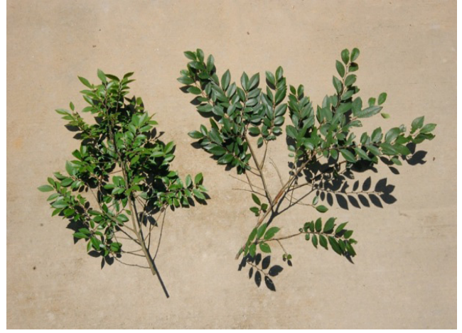
Suspended pavement twig on the left; Structural Soil twig on the right.

less vigorously. In addition to the type of soil and its compaction, the net volume of soil is critical to predicting the long-term growth of the tree. A typical large canopy tree needs in excess of 1,000 cf of loam soil to reach a large enough size to create significant environmental benefits. It is often quite difficult to find the space for this amount of soil along urban streets.