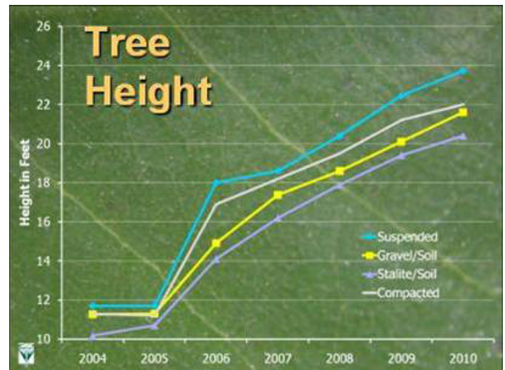
Year 6 results from an independent study by the Bartlett Tree Lab.

Trees grow best in loosely compacted loam soil, the type that can be installed in Silva Cells. The ideal growing conditions mean faster tree recovery from transplanting and rapid growth. Tree growing in loam soil in Silva Cells have responded exceptionally well in numerous applications over the 6 years since their introduction. Conversely, trees growing in Structural Soil recover from transplanting more slowly and grow