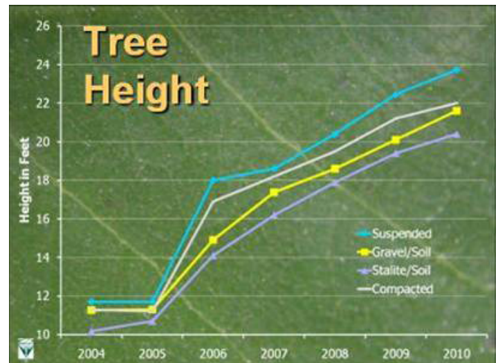
Year 6 results from an independent study by the Bartlett Tree Lab.

Trees grow best in loosely compacted loam soil, the type that can be installed in Silva Cells. The ideal growing conditions mean faster tree recovery from transplanting and rapid growth. Tree growing in loam soil in Silva Cells have responded exceptionally well in numerous applications over the 6 years since their introduction. Conversely, trees growing in Structural Soil recover from transplanting more slowly and grow