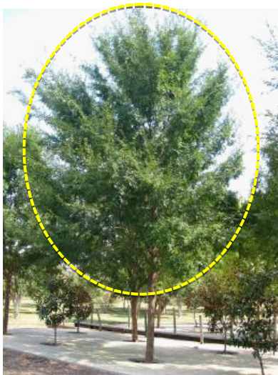
Year 6: Tree growing in Suspended Pavement at the Bartlett Tree Lab.