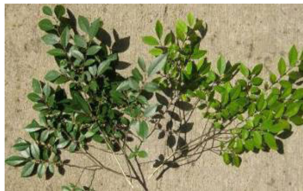
Year 6: Suspended pavement twig on the left; Structural Soil twig on the right.

less vigorously. In addition to the type of soil and its compaction, the net volume of soil is critical to predicting the long-term growth of the tree. A typical large canopy tree needs in excess of 1,000 cf of loam soil to reach a large enough size to create significant environmental benefits. It is often quite difficult to find the space for this amount of soil along urban streets.