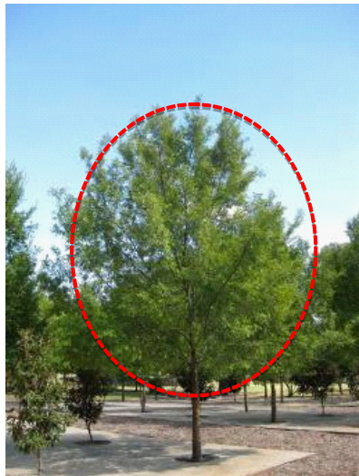
Year 6: Tree growing in Structural Soil at the Bartlett Tree Lab.