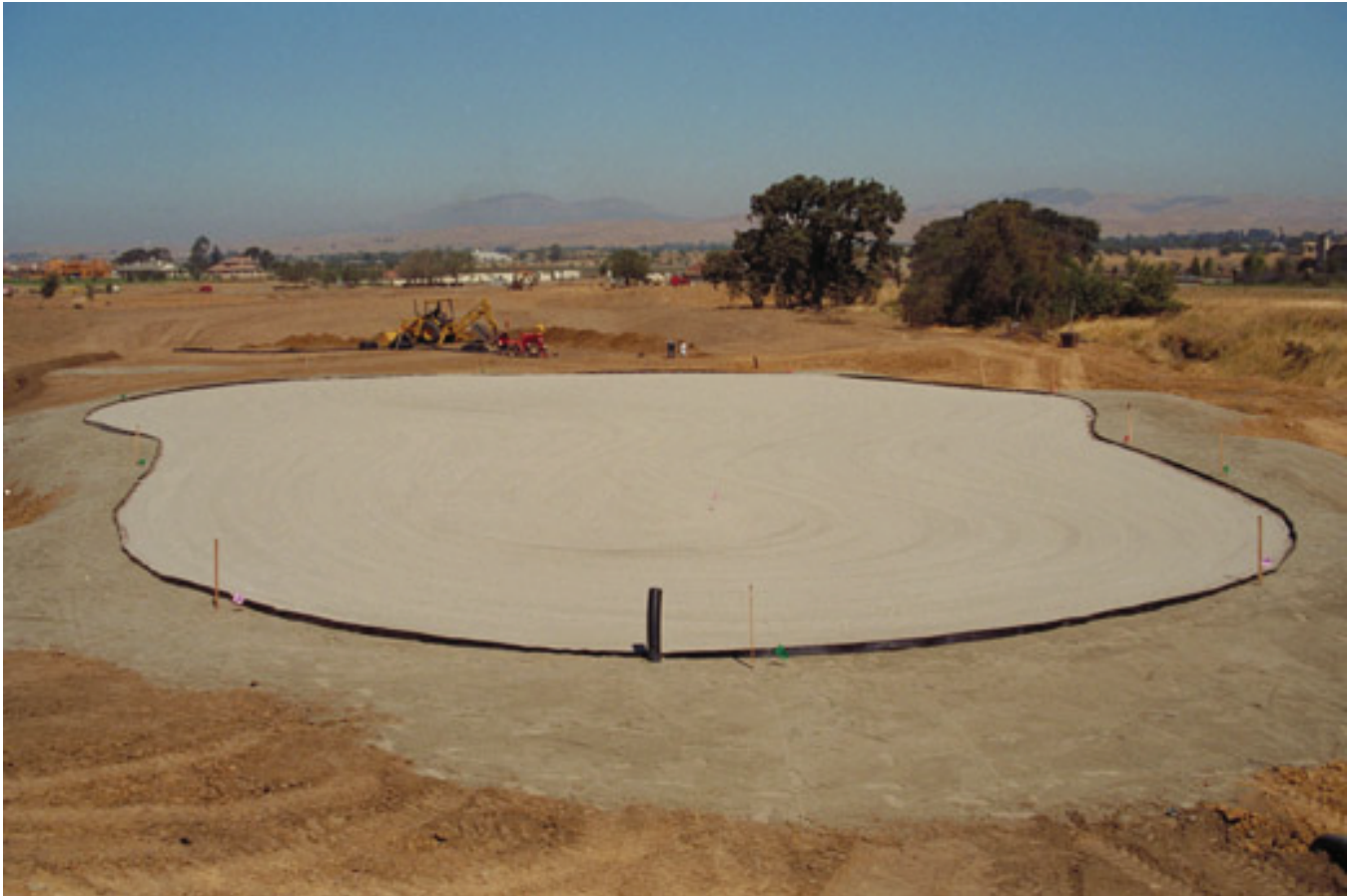
WB Installation - 1996

By lining the outside of the green with DeepRoot WB 24-2 all three key issues were addressed.